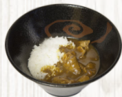
Any Rice Bowl (Regular Size)