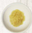
Sweet & Spicy Ginger Paste