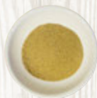
Dried Bonito Powder