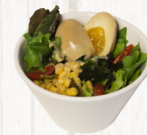
House Salad (Sesame or Wasabi Yuzu) or Seaweed Salad